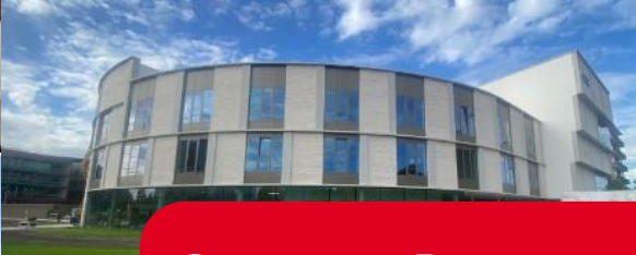
Campus Brugge ✓ Xaverianenstraat ✓ Station