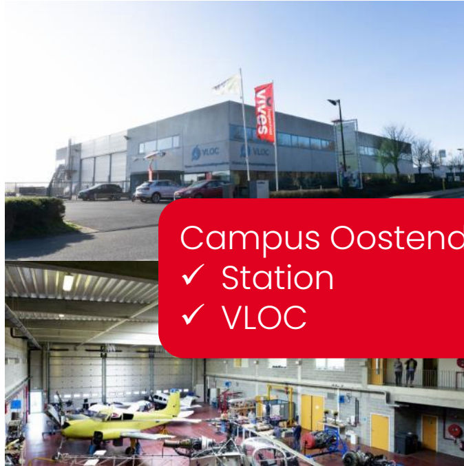
Campus Oostende ✓ Station ✓ VLOC